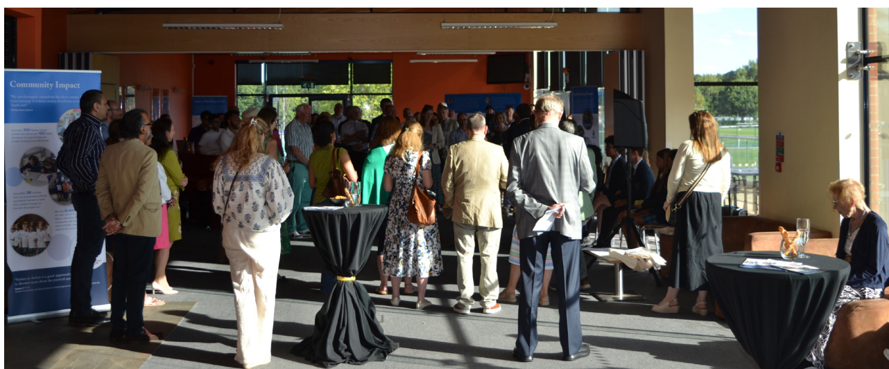
Guests gather round to hear from our student panel at the Donor Impact Drinks Reception

and compassion; the bursary recipients whose lives have been transformed through the gift of education; the young musicians who have opportunities they might never have even considered previously, thanks to philanthropy; or the young men and women whose student experience was shaped by the inspirational facilities they have been able to study in, thanks to people like you. None of those stories would have happened without each and every one of our generous donors. Whether you have given £10, £10,000 or even more, your gift will make a difference to future generations of Foundation students, and we are so grateful to you all for your support. Thank you.