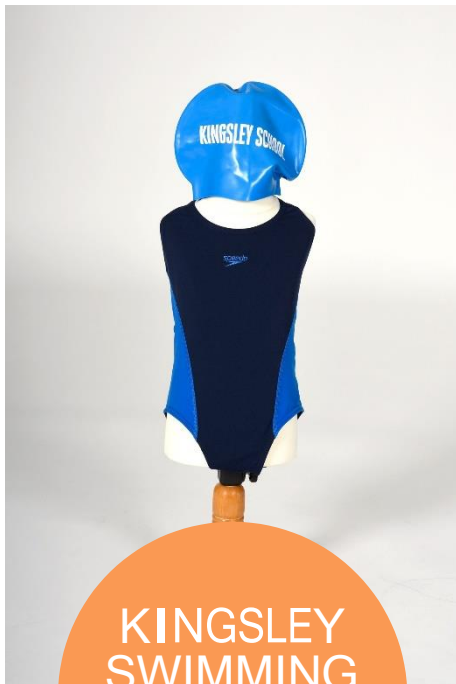
KINGSLEY SWIMMING COSTUME AND HAT