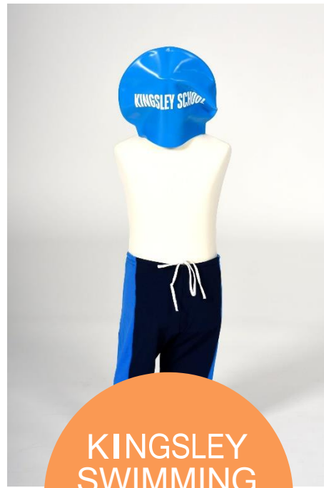
KINGSLEY SWIMMING TRUNKS AND HAT