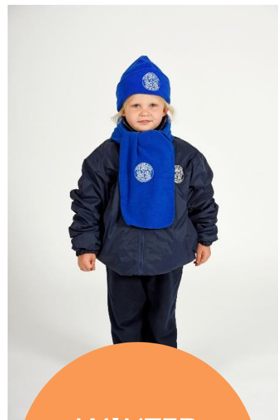
WINTER COAT, HAT AND SCARF