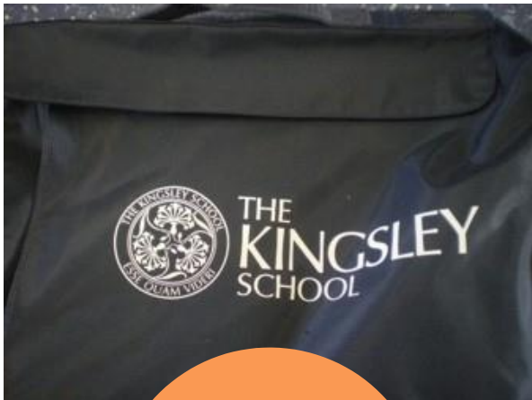
BOOK BAG/ BACKPACK