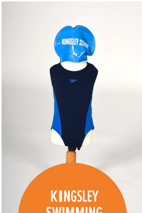
KINGSLEY SWIMMING COSTUME AND HAT