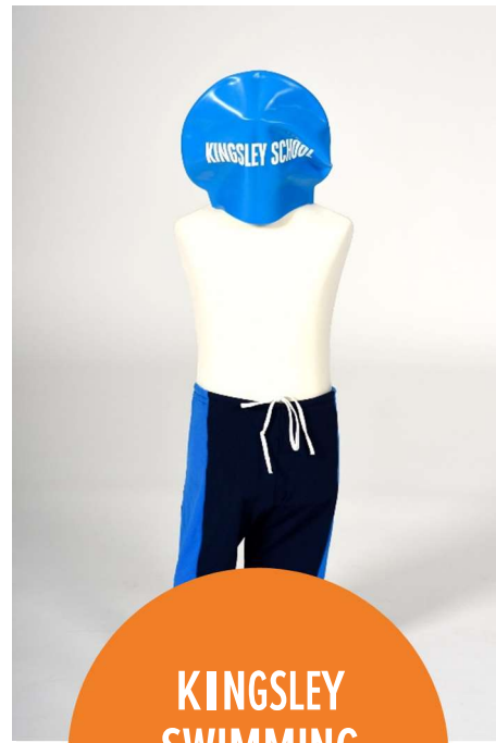
KINGSLEY SWIMMING TRUNKS AND HAT