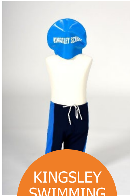
KINGSLEY SWIMMING TRUNKS AND HAT