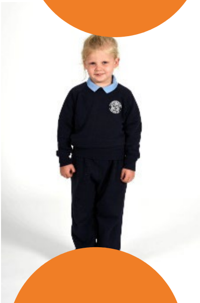
GIRLS' PF KTT