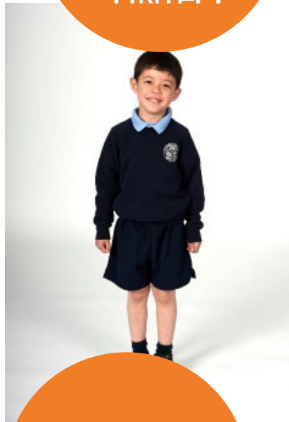
BOYS' PF KTT

Please make sure all your uniform has your name on it.