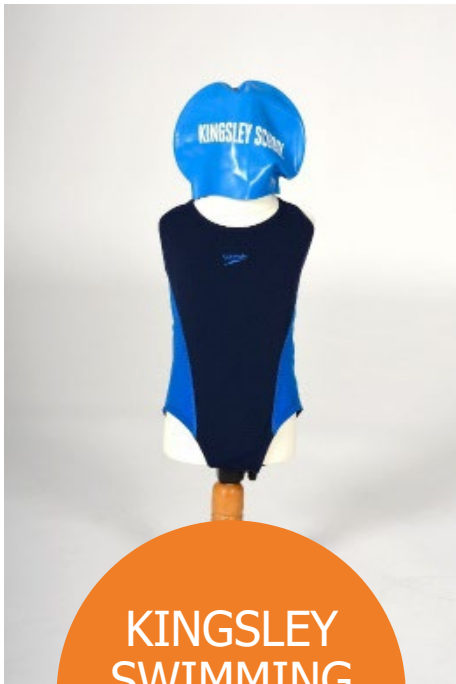
KINGSLEY SWIMMING COSTUME AND HAT