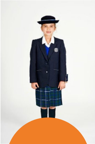
GIRLS' WINTER UNIFORM